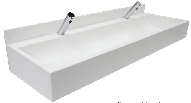
Base unit by others