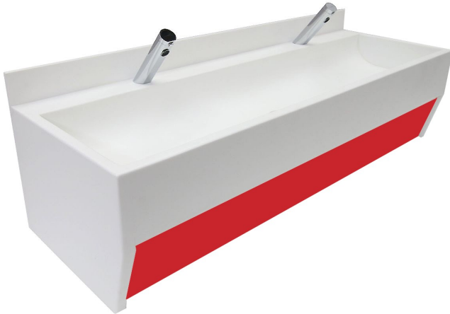
Sit-on Vanity Mounted